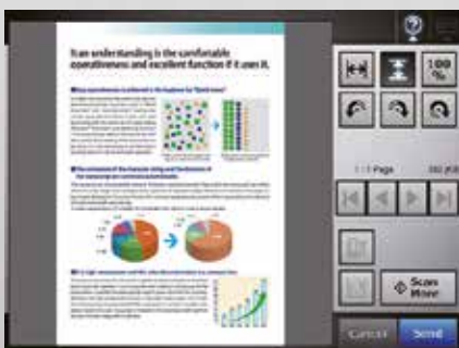
Preview screen (Scan viewer)

An SDK is available for the N7100 to further meet the needs of your business. This SDK will enable developing a connector to a preferred third-party application, may that be a DMS, ECM, BPM or ERP system. This connector in turn is uploaded to the N7100 and then acts as a one button door opener into the productive target systems. The SDK additionally provides for utilising IC readers attached to the network scanner's USB port.