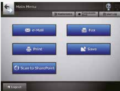
Main Menu screen

The N7100 satisfies the digitising needs in larger scale networks as well as in environments where more basic file servers and e-mail servers are deployed. It is right at home with more complex LDAP/LDAPS authentication-based networks, and allows for integration with Microsoft Exchange Servers, FTP servers, third party applications and portal and collaboration platforms.