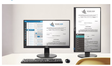
EasyRead mode for a paper-like reading experience