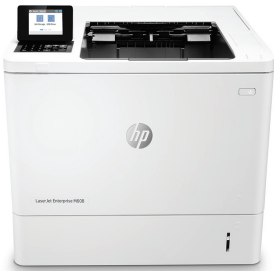
HP LaserJet Enterprise M608n

This HP LaserJet Printer with JetIntelligence combines exceptional performance and energy efficiency with professional-quality documents right when you need them – all while protecting your network from attacks with the HP's deepest security 1